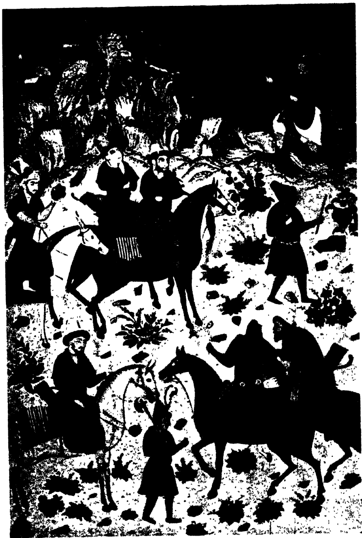
A PERSIAN HUNTING SCENE, EARLY SEVENTEENTH CENTURY.

This shows the types of weapons used for the chase.